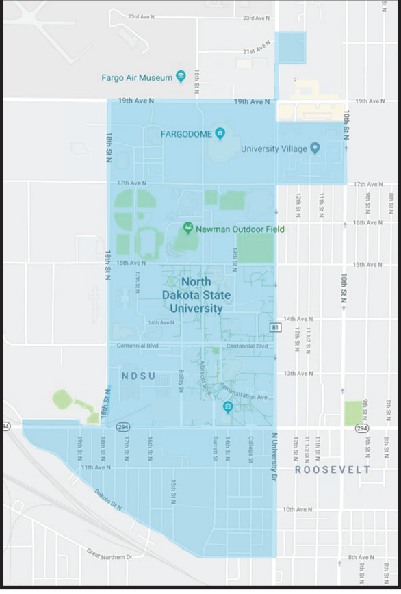
7:30 p.m. - 11:00 p.m. Monday through Friday (academic year only)